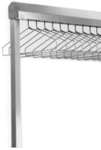
shown with single gowning rack – freestanding for non-removable hangers