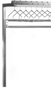
shown with cantilevered gowning rack – freestanding for removable hangers