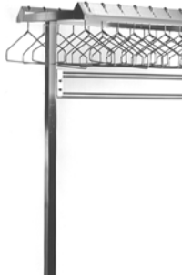
shown with double gowning rack – freestanding for removable hangers