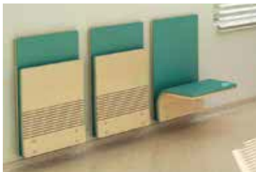
FOLD DOWN SEATING