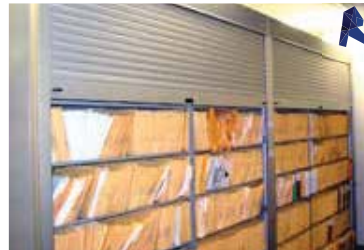
SECURITY ROLLING DOORS