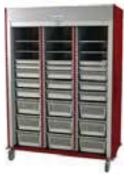
CARTS WITH GLASS DOORS

and records lifecycle management; and stainless steel and metal modular cabinets and casework, we can help you maximize your resources. We have numerous GPO contracts and will assist you throughout the entire planning, design, and installation process.