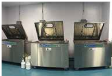
SURGICAL DEVICE WASHERS