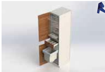
PASS THRU WALL CABINETS