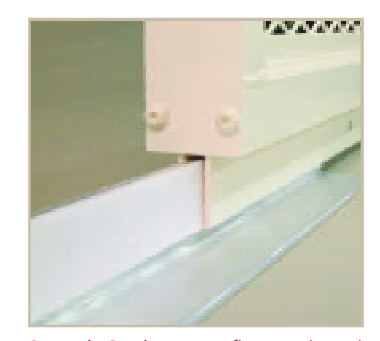
Smooth Guidance – A floor-anchored aluminum guide angle with conservation-safe felt eliminates metal to metal contact reducing vibration.