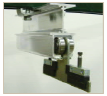
Vibration Dampening – The overhead track and precision frictionless roller guide trolley contains molded silicone rubber isolators to protect collection from vibration.