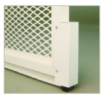
Sway Prevention – Protection of stored material is enhanced with an anti-sway guide wheel mounted at the front base of each panel.