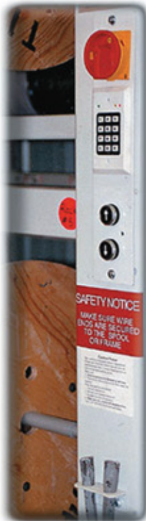
Digital Security Keypad