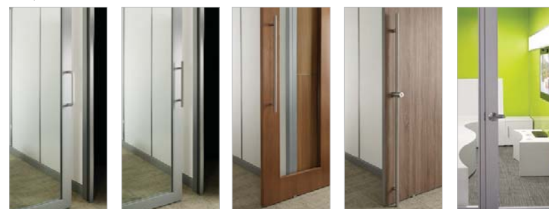
12" D Pull