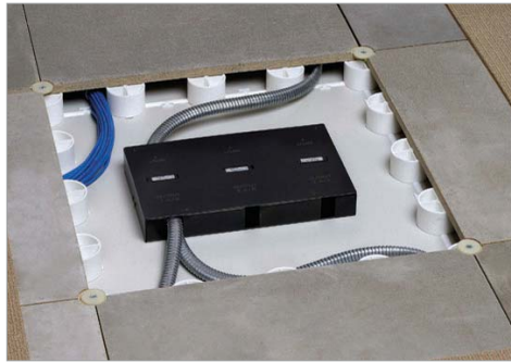
Choose pre-wired, field-wired or PowerPac floor access.

From training spaces to conference rooms to open environments, our raised access flooring can save you time, money and headaches with every move and reconfiguration you require.