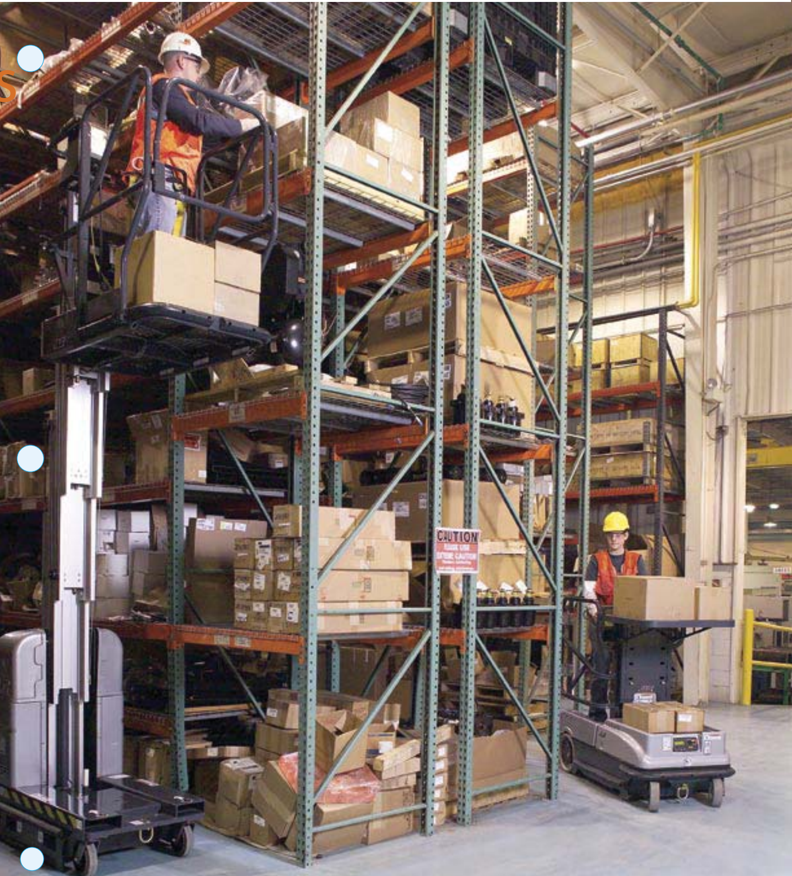
With a compact design and outstanding maneuverability, SSG MSP stock pickers are ideal to get close to shelving and materials.