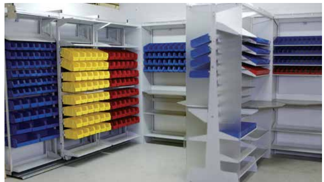
FrameWRX® Storage Systems Hang bins, trays and pegs on our modular FrameWRX Storage System's innovative rail system to maximize storage of a wide variety of evidence-processing supplies. With the flexibility to adapt to changing needs quickly and easily, FrameWRX Storage System provides highly customizable storage.