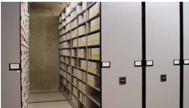
High-Density Mobile Storage (HDMS) Systems Once evidence is logged, Spacesaver HDMS Systems help maintain its integrity indefinitely.

Our Evidence Lockers have been redesigned with a new, highly secure locking system and flush-mounted handle.