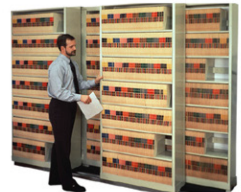
Lateral Sliding Shelves