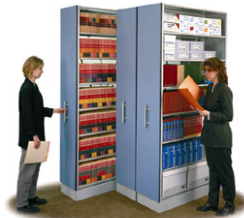
Pullout Storage Unit