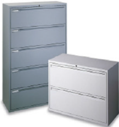
Lateral File Cabinets