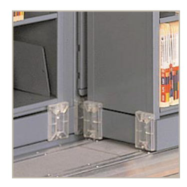
Standard In-Rail Anti-Tip on levelable rail.