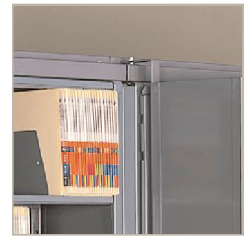
Optional Overhead Anti-Tip.