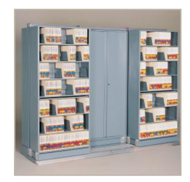
Optional locking hinged doors provide security.