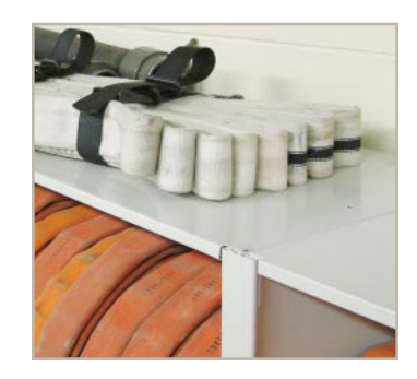
Canopy Top acts as a dust shield to keep hoses cleaner and provides space for additional storage.

Durable – Powder Coat finish provides a durable smooth surface for sliding hoses in or out, while resisting scratches and abrasion.