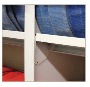
Hose cradles are factory welded and interlock securely to upright posts for fast and easy installation.