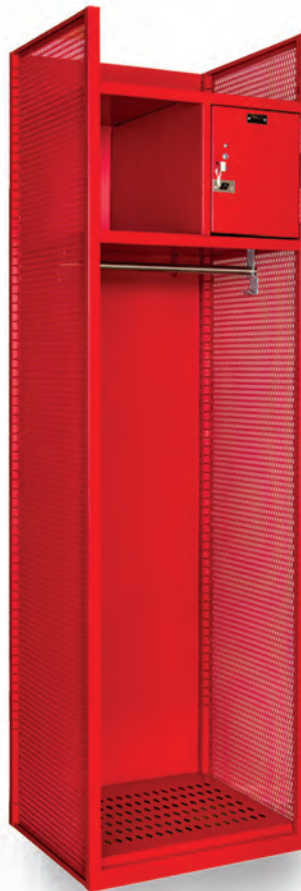
With Upper Security Box Without Base