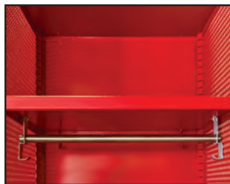
Fixed hat shelf with stainless steel coat rod with 2 single prong hooks & 2 single prong hooks at back