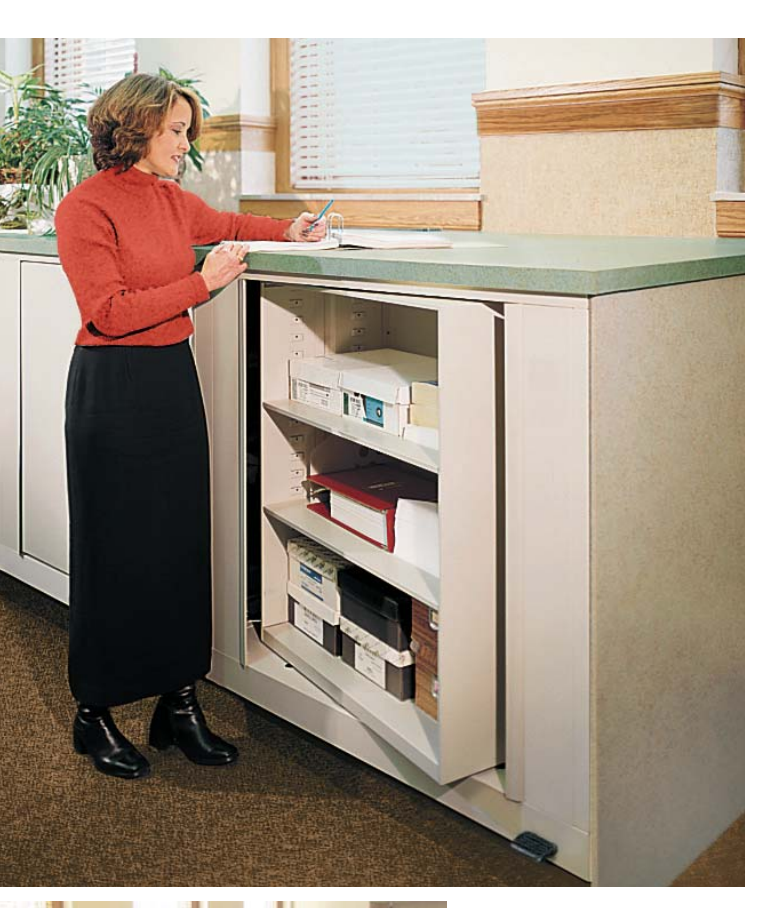
Rotary systems provide convenient access to active court records.

The Lake County Court House in Painesville, Ohio was in need of expansion. They purchased an old post office building located next door and remodeled it for the Clerk of Courts offices, as well as other offices.