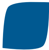
Capri Blue 701