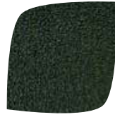
Black Wrinkle 903