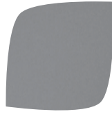
Dove Grey 304