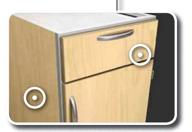
Cabinet can be accessorized with HPL or Thermofoil finishes

* Base cabinet pictured above has nickel powder coated steel body with aluminum framed doors and drawers with clear acrylic panel inserts.