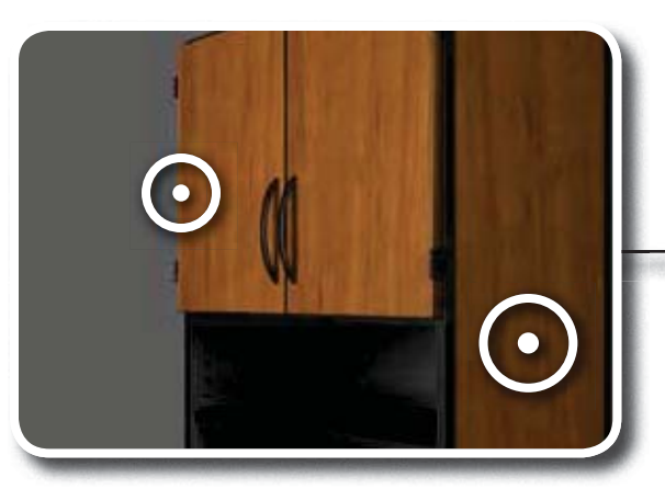
Cabinet can be accessorized with HPL or Thermofoil finishes

* Wall cabinet pictured above has black powder coated steel body with aluminum framed doors – doors contain aluminum panel inserts w/ brushed stainless steel finish. 7