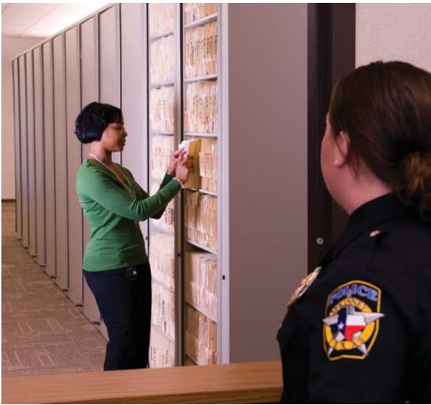
Custom-designed rotary files, measuring nearly seven feet tall, take advantage of vertical wall space to efficiently store McKinney PD's case files and department records. Only authorized personnel have access to the rotary file system.

One carriage of the Eclipse Powered System incorporates a hanging file system for storing items such as CDs, DVDs, squad car video systems, and audiocassette tapes.