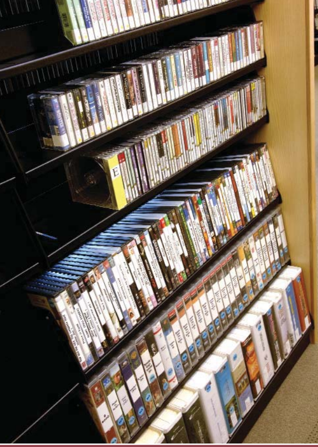
Shelving in the multimedia area is fully adjustable to meet library needs now and in the future.