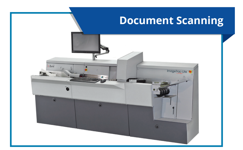
We provide on-site or off-site document imaging services in our secured location with HIPAA and CJIS compliant staff and processes.

Store, retrieve, and organize your file system at the push of a button while saving space and providing ADA compliance. Files and requested items are automatically delivered to an ergonomic work counter without walking and searching.