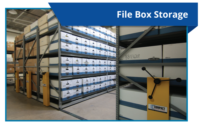
File box shelving allows you to manage your space and organize your business's boxes and archival records efficiently. High capacity racks can store even the heaviest boxes for bulk storage.

Library cantilever shelving organizes and stores your books, binders, and other files efficiently and allows employees to find and retrieve needed items quickly.