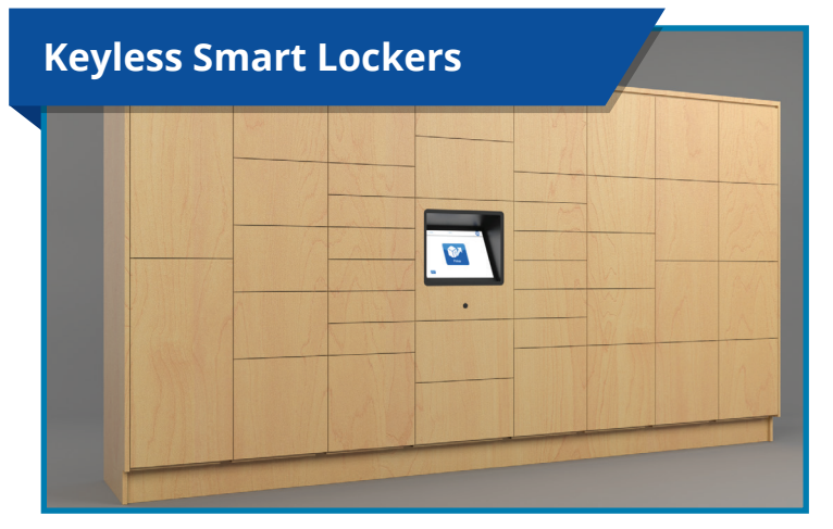
Smart lockers make package tracking and auditing easy and stress-free. Packages and parcels are simply dropped off, and an automatic alert is sent to the recipient for delivery pick-up at their next convenience.

High density shelving reduces your storage footprint for storing files, folders, binders, record boxes and supplies by half along with increasing productivity by allowing stored files to be better organized and accessible.