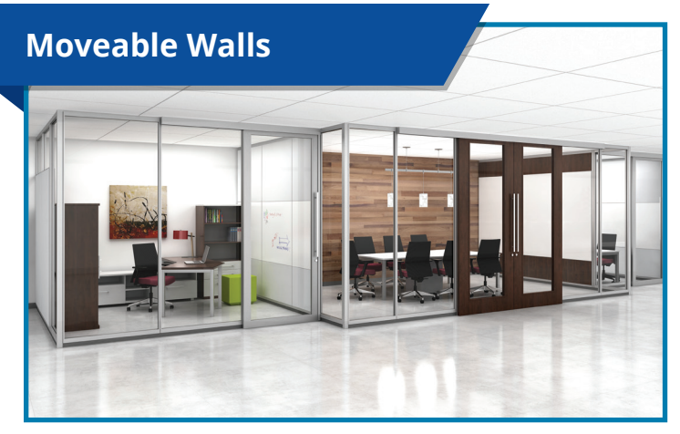
Unlike drywall construction, these walls can be taken down, moved, or added to at any time to create flexible office spaces and partitions. If you relocate, the walls simply move with you.

A wide variety of mailroom furniture and mail sorters are available to keep your space organized. These solutions can be designed & factory-made to your exact specifications and shipped directly to you.