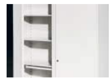
<u>Hinged Doors</u> Provides protection and security for all materials being housed in the lockable shelving cabinet.