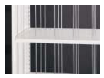
<u>Divider Rods</u> Designed for convenient, compartmentalized storage.