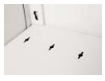
<u>Universal Shelf</u> Unique, patented design allows for attachment of file dividers, bin dividers and divider rods.