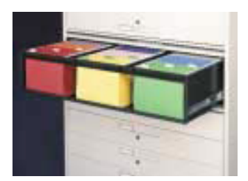
Roll-Out Interior Drawer Can be configured for top-tab hanging folders or open-shelf filing of top or side-tab folders.