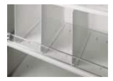
Bin Divider With Acrylic Bin Front Compartmentalizes the storage of three-dimensional objects and other media.