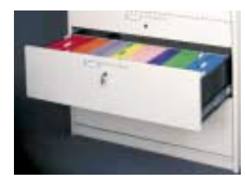
Closed File Drawer Combines security with space efficiency. Can accommodate letter or legal sized files, hanging folders and more. Quickly accessible.