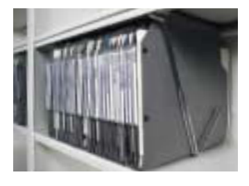
<u>Hanging Files</u> Provides openshelf access to file folders that are contained in suspended compartments.