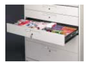
Storage Drawer Accommodates a wide variety of stored media while providing full accessibility and keyed security. Adjustable bottom dividers available.