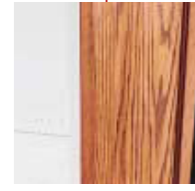
<u>Aesthetic Flexibility</u> Optional end-panels are available in laminates, wood veneers and metal finishes to create a designer look.

<u>Front Bases</u> Optional front bases provide an attractive, finished look.