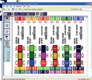
...then just PREVIEW, PRINT, and you're done!